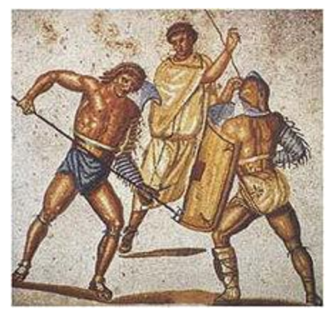
2000 years ago, Roman civilization dominated Europe. They built roads, temples and water systems.

What will you leave behind that will last 2000 years?